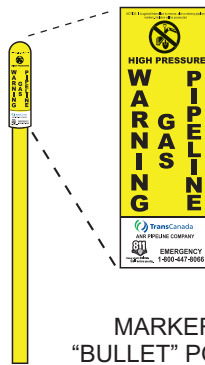
MARKER "BULLET" POST