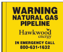
SIZE: 4" x 5" Flag COLORS: Yellow w/ Black letters