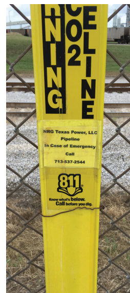
NRG Plant Header: 24" [600 psi]