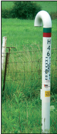
1. Vent Pipe