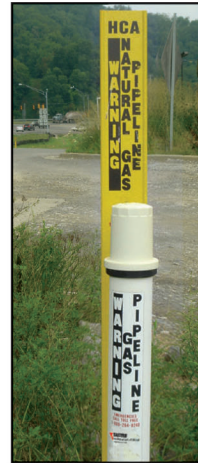
5. HCA marker and cathodic protection test station