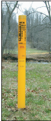
3. High-consequence area entrance or exit marker (arrow on top)