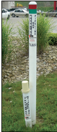
2. Linemarker and cathodic protection test station