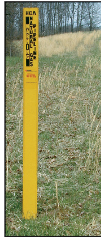
4. HCA line-of-sight marker