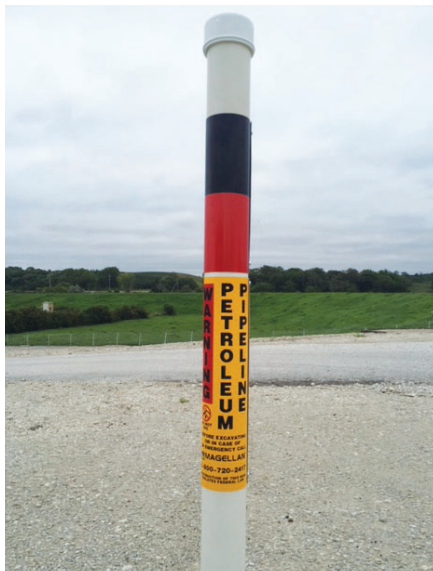
Our pipeline markers can be typically identified by the black and red bands at the top.

Magellan Midstream Partners, L.P., a wholly owned subsidiary of ONEOK, Inc., is principally engaged in the transportation, storage and distribution of refined products and crude oil. Magellan operates a 9,800 mile refined products pipeline system with 54 connected terminals as well as 25 independent terminals not connected to our pipeline system, two marine terminals (one of which is owned through joint venture) and a 2,200 mile crude oil pipeline system.