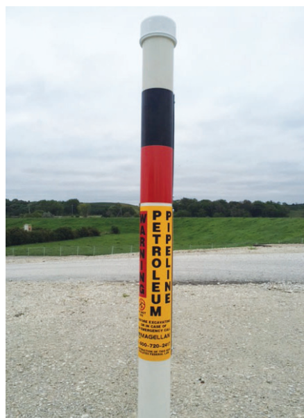
Our pipeline markers can be typically identified by the black and red bands at the top.

Magellan Midstream Partners, L.P. is a publicly traded limited partnership, principally engaged in the transportation, storage and distribution of refined products and crude oil. Magellan operates a 9,800 mile refined products pipeline system with 54 connected terminals as well as 25 independent terminals not connected to our pipeline system, two marine terminals (one of which is owned through joint venture) and a 2,200 mile crude oil pipeline system.