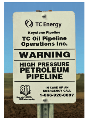
Typical TC Energy Keystone marker sign on the pipeline right of way (ROW) at road/railway and canal crossings