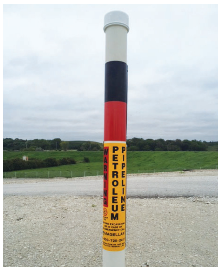
Our pipeline markers can be typically identified by the black and red bands at the top.

Magellan Midstream Partners, L.P., a wholly owned subsidiary of ONEOK, Inc., is principally engaged in the transportation, storage and distribution of refined products and crude oil. Magellan operates a 9,800 mile refined products pipeline system with 54 connected terminals as well as 25 independent terminals not connected to our pipeline system, two marine terminals (one of which is owned through joint venture) and a 2,200 mile crude oil pipeline system.