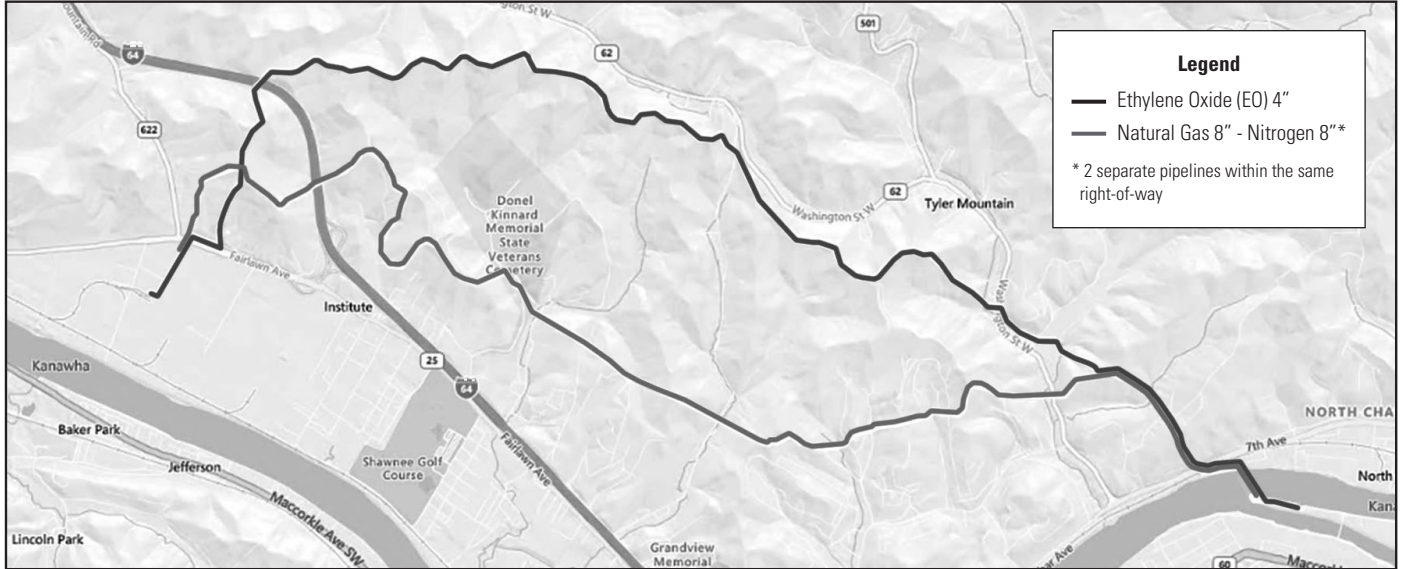
Base map courtesy of openstreetmap.org